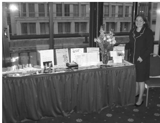
Law Library Lights covers from the past